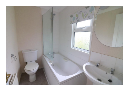
Ground Floor Approx. 31.7 sq. metres (341.7 sq. feet)